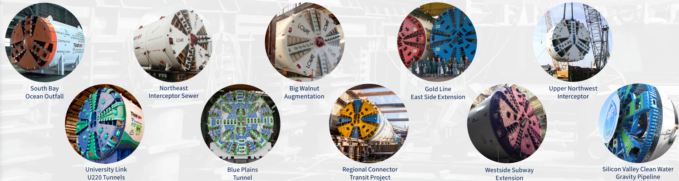
South Bay Ocean Outfall